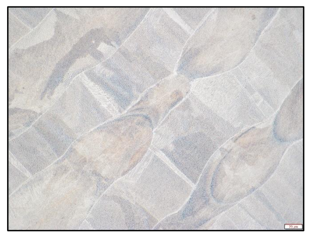
Metallographic samples at 200 x magnification following etching with electrolytic 10% Oxalic acid

The results of the testing showed that Aurora can print SS 316L consistent with the material properties required.