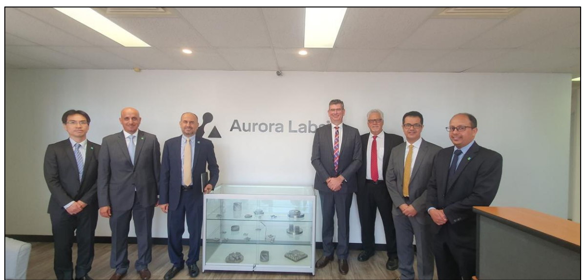
Aramco MOU site visit.

In June, Aurora announced it had signed a non-binding Memorandum of Understanding (MOU) with Aramco, which outlined potential cooperation areas, including the exchange of information regarding Aurora's upcoming AL250 metal 3D printer, its high-power printing capabilities and its patented MCP™ technology. The MoU also outlines exchange of information regarding Saudi Arabia and Gulf Cooperation Council (GCC) markets, and potential joint development of opportunities in the 3D printing business.