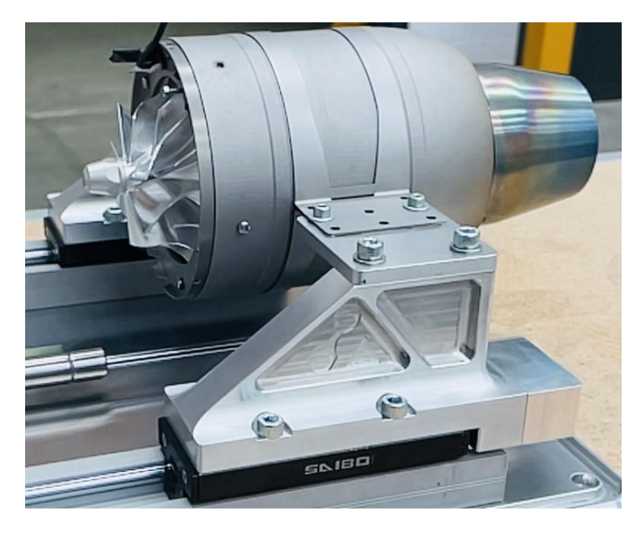
Figure 2: 3D Printed gas turbine, being readied for inspection after successful test fire.

The supply of our engine which is sovereign designed, manufactured and assembled is of particular importance in supporting defence capabilities which are Australian based, and fits well with the pillars of the Australian Defence Review, 2023.