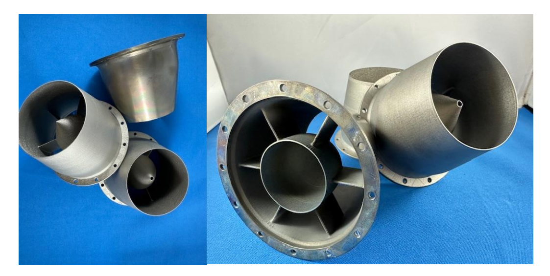
Figure 3: Turbine exhaust nozzle prototypes in test

Printed 3D metal parts and the use of additive manufacturing in the defence and aerospace industries will continue to be promoted to both large and small enterprises seeking innovative solutions provided by additive manufacturing, particularly with targeted geometries which excel in 3D metal printing.