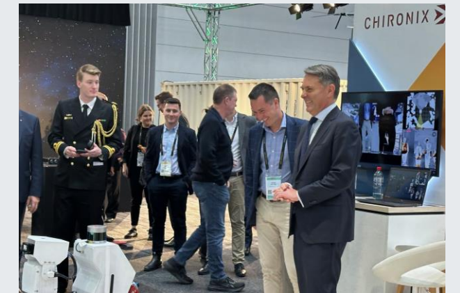
Richard Marles at the Defence West Stand, Land Forces 2024 7