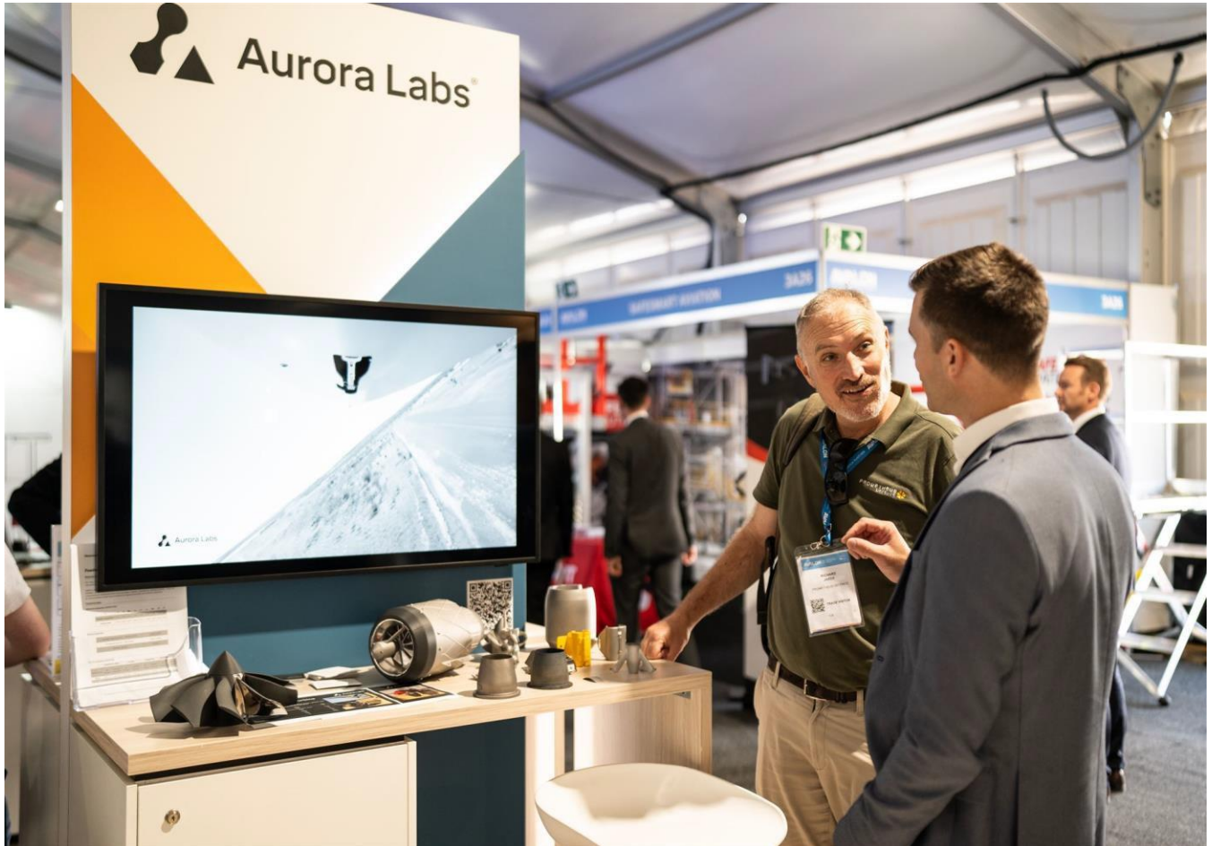
Avalon Air Show, 2025